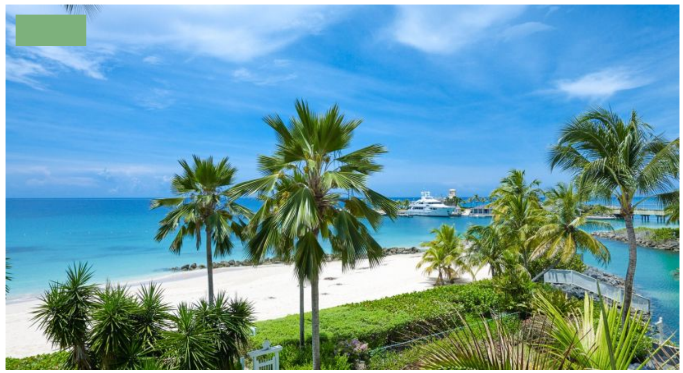
PORT ST. CHARLES, PENTHOUSE #380, ST. PETER, BARBADOS