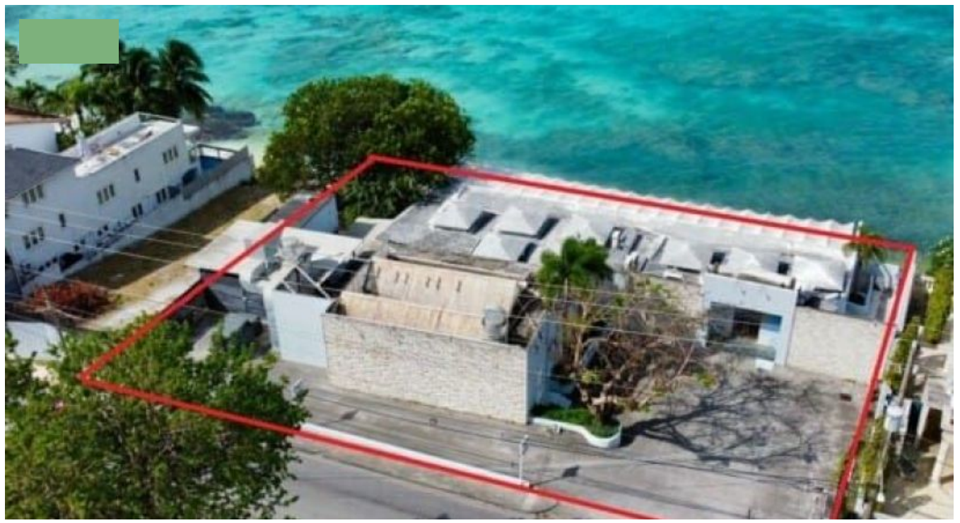
REDUCED- 'SIESTA', PRIME BEACHFRONT LOT IN PROSPECT, ST. JAMES