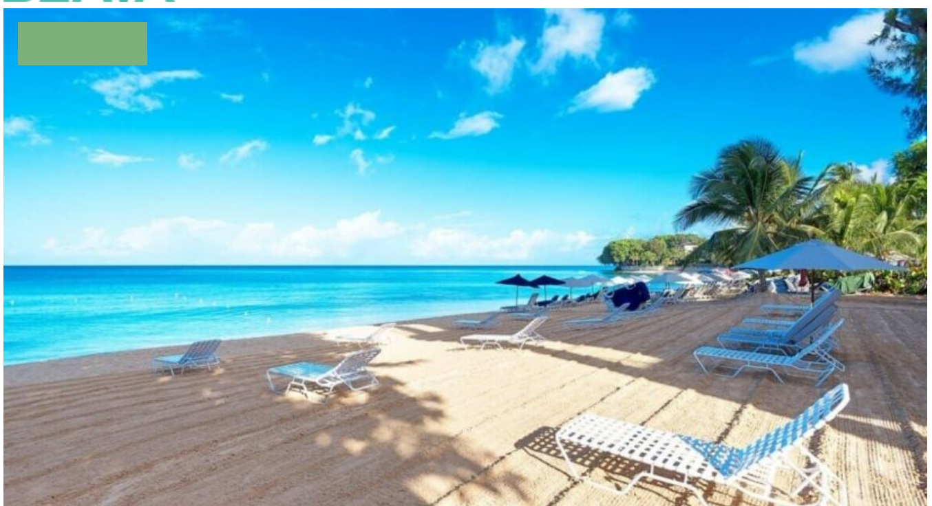
THE VILLA AT THE ST. JAMES - LUXURY HOLIDAY RENTAL, BARBADOS