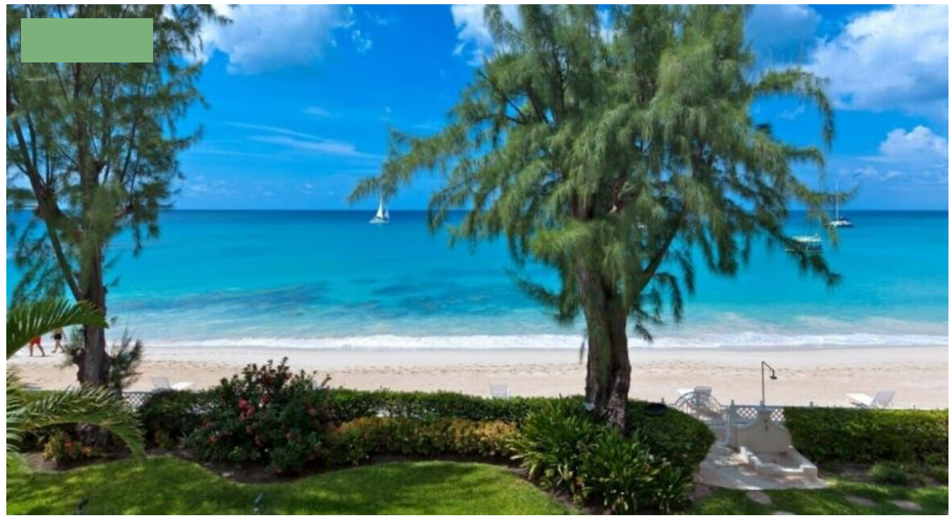
OLD TREES 7 – BELLA VISTA – LUXURY HOLIDAY RENTAL, BARBADOS