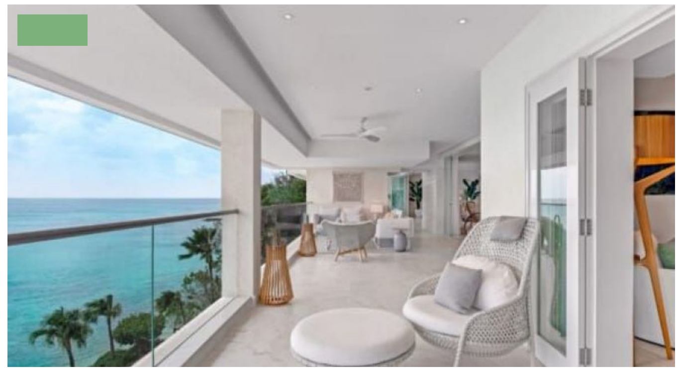
REDUCED - ULTRA LUXURY 6 BED BEACHFRONT APARTMENT -PORTICO, ST JAMES