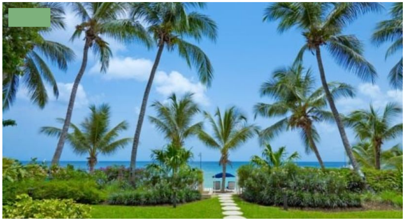
REDUCED - SMUGGLERS COVE 6, PAYNES BAY, ST. JAMES