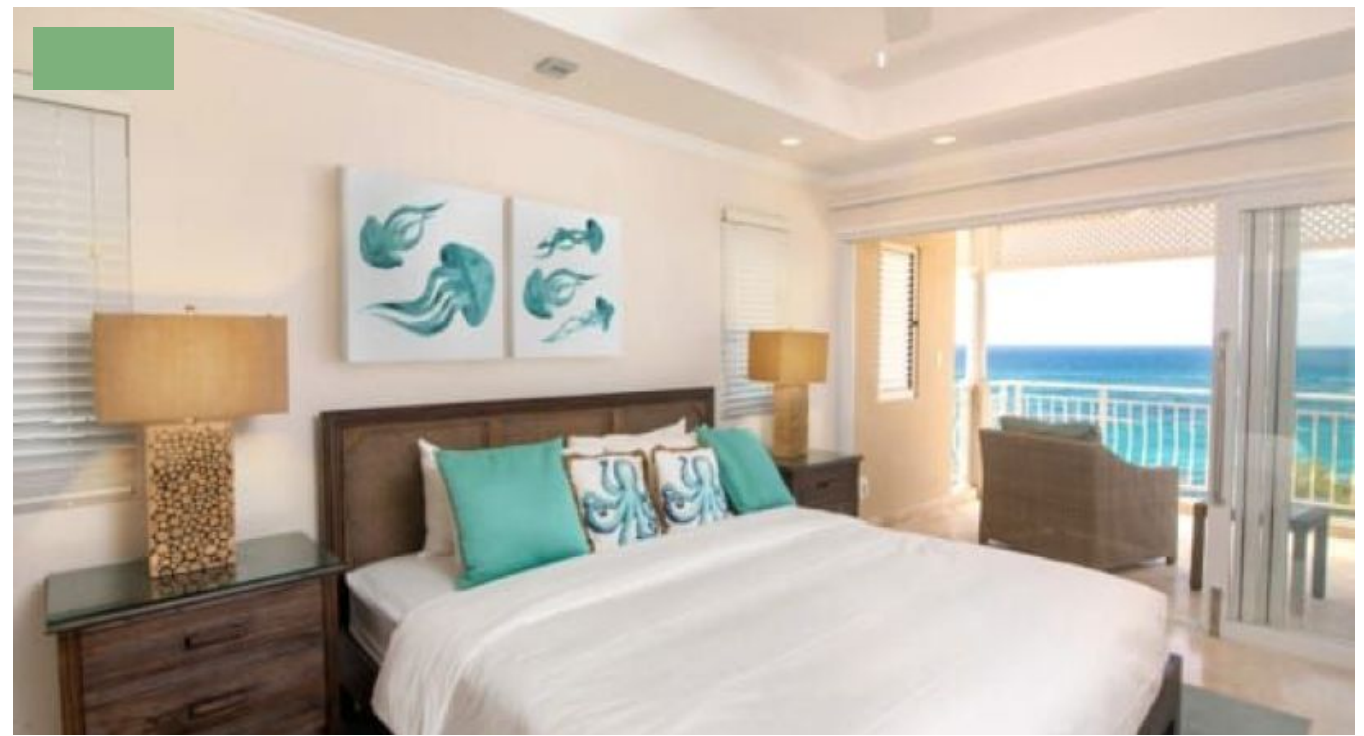
THE CRANE PRIVATE RESIDENCES, OCEANVIEW, BARBADOS - PHASE 3