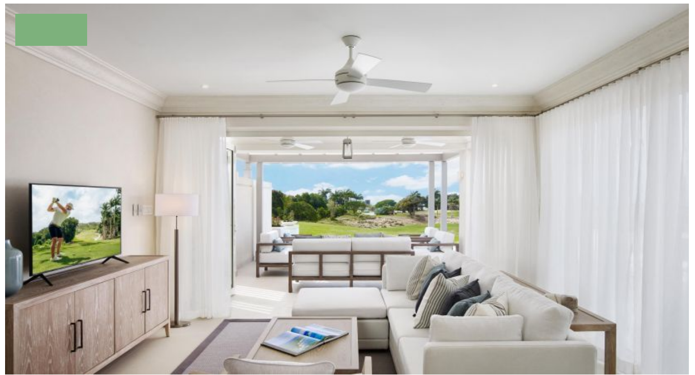
APES HILL, COURTYARD VILLA #17, ST. JAMES, BARBADOS