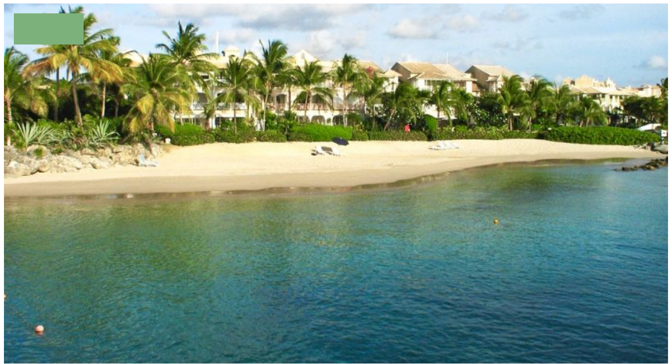
PORT ST. CHARLES, UNIT 150, ST. PETER, BARBADOS