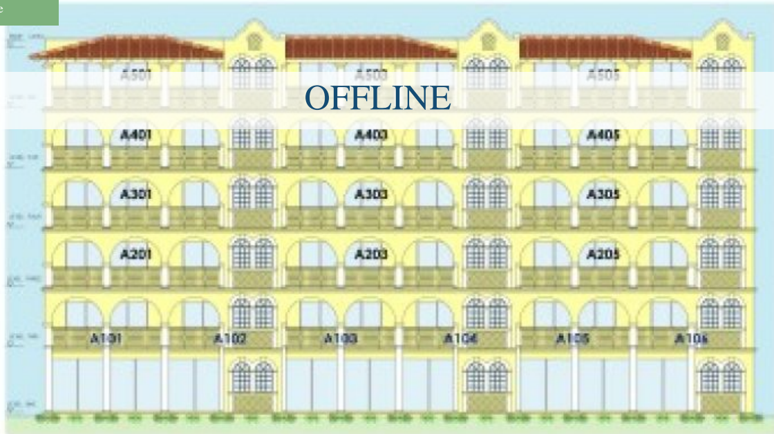
Sapphire Beach Residential Condominiums West Beachside Elevation (Block A)